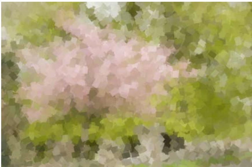
Dense Sponge size 60