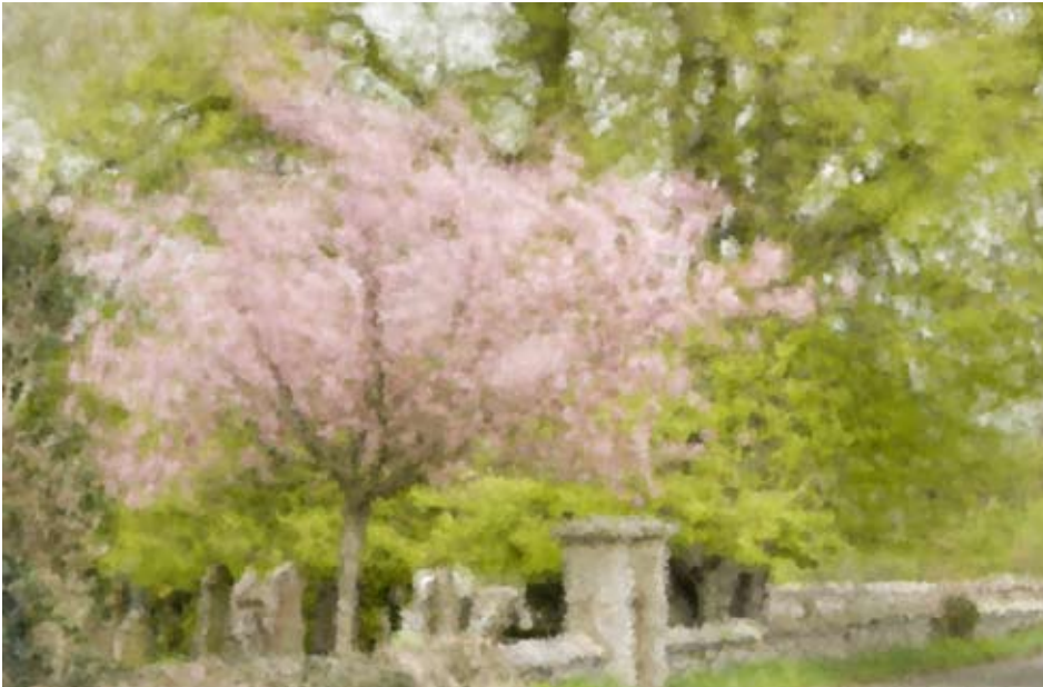
Dense Sponge size 15

14. Change the brush size to 15 and run the auto-painting again.