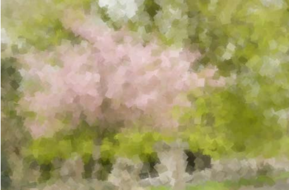
Dense Sponge size 30

12. Change the brush size to 30 and run the auto-painting again.